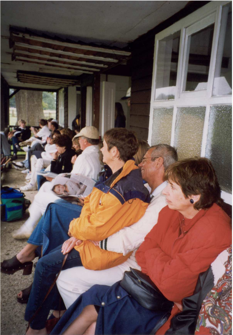
A typical English summer scene – 40th President's game