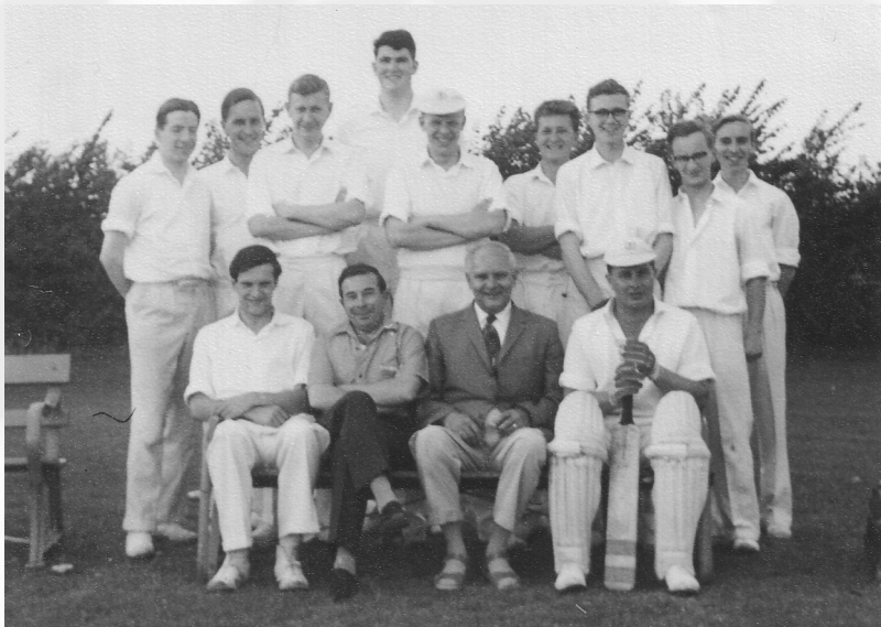
1962: 18th August at Rosehill vs. Montrose

During the 70s many new members joined the Club and helped maintain the friendship and camaraderie that has always been the most important feature of playing for the Badgers. Lots of friendships were made which continue today and we all owe a deep debt of gratitude to everybody who made the Badgers what it was and what it remains.