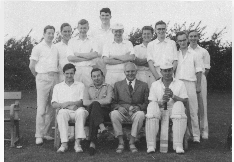
1962: 18th August at Rosehill vs. Montrose

During the 70s many new members joined the Club and helped maintain the friendship and camaraderie that has always been the most important feature of playing for the Badgers. Lots of friendships were made which continue today and we all owe a deep debt of gratitude to everybody who made the Badgers what it was and what it remains.