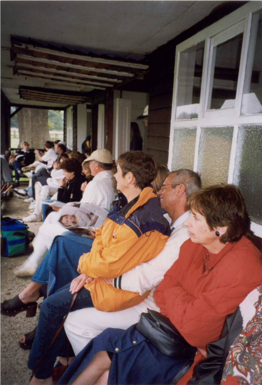
A typical English summer scene – 40th President's game